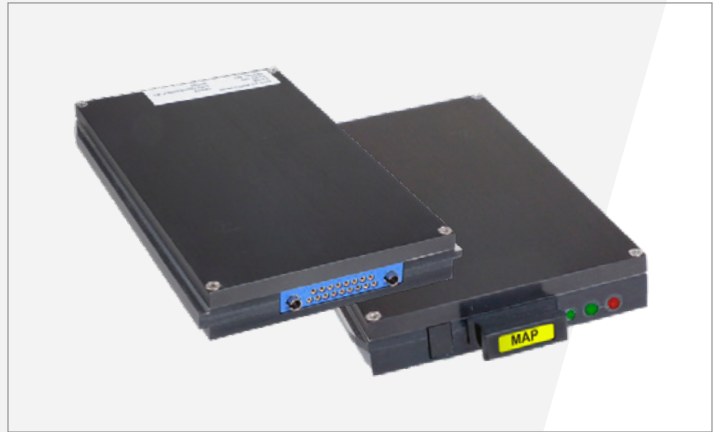
Figure 4: RMC rear and front views

The DTS1 RMC was uniquely designed to avoid obsolescence issues and increase insertion cycles. The RMC is based on industry standard 2.5" SATA SSDs enabling the RMC to take advantage of the broad industrial base and incorporate any of the widely available 2.5" SSDs up to 8TB currently. As a result, the RMC design allows DTS1 to leverage the dynamic and fast paced technical developments of the SSD industry. Read the white paper " Choosing the Best Location for Your Data-At-Rest Encryption Technology ".