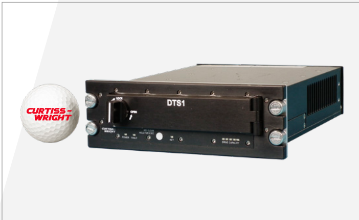
Figure 3: DTS1 with DZUS mounting