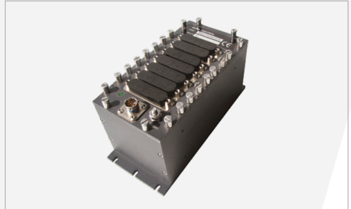
Figure 5: Acra KAM-500

A separate partition can be set up for storage of PCAP files. That partition can be equipped with its own unique software encryption passphrase providing access control if required.