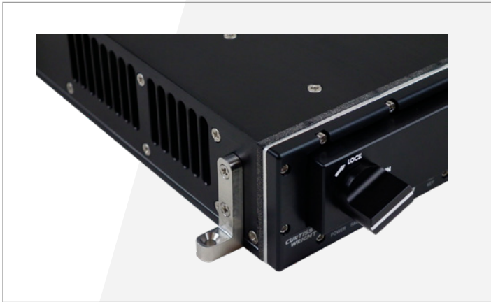
Figure 2: DTS1 with L-bracket mounting

The DTS1 provides two mounting options that make it easy to integrate into your platform: DZUS panel or L-brackets. The DZUS flange allows the unit to be mounted in a standard panel mount. Alternatively, the DTS1 comes with four L-brackets attached to threaded holes on the sides. With the L-brackets, the DTS1 can be bottom-mounted, top-mounted, or side mounted. This flexible option allows the use of a conduction-cooled plate for severe environments.