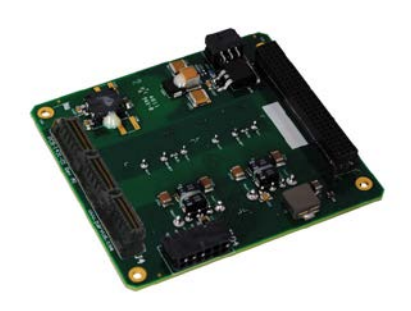
Top View of PWR-22-11 (PCI/104-Express)