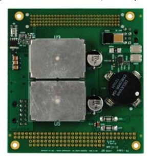
Bottom View of PWR-21-11 (PC/104-Plus)